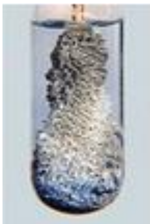
End of reaction