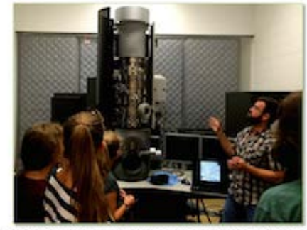
Energy & Materials Discovery Camp