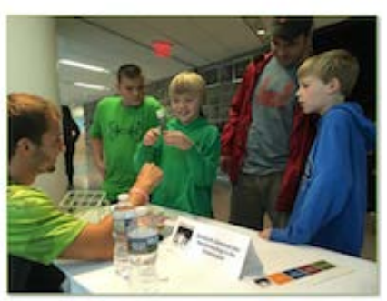
Virginia Tech Science Festival