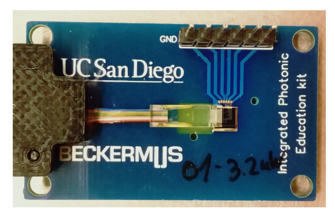
Integrated Photonics Educational Kit (IPEK) prototype Board